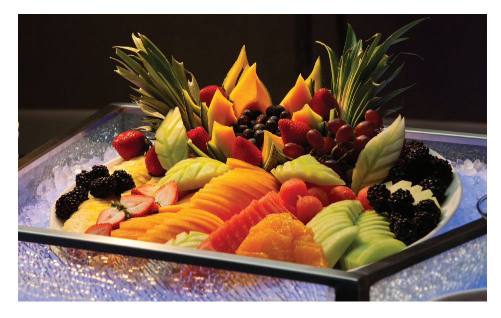
All prices listed are subject to 25% Taxable Service Charge and 6.5% Sales Tax.