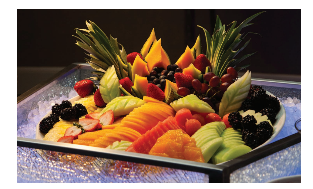
All prices listed are subject to 25% Taxable Service Charge and 6.5% Sales Tax.