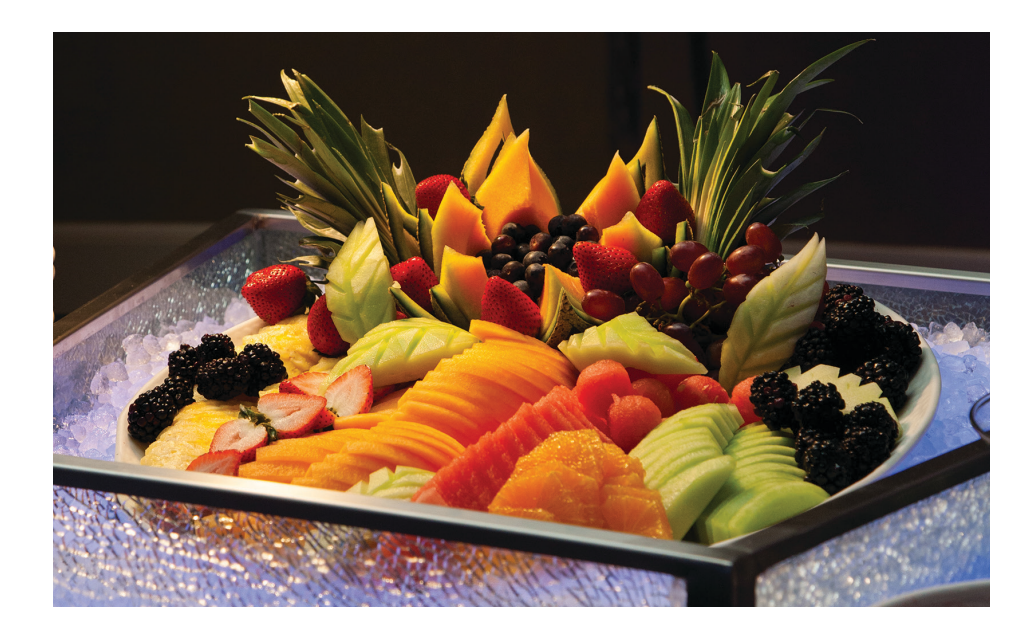
All prices listed are subject to 26% Taxable Service Charge and 6.5% Sales Tax.